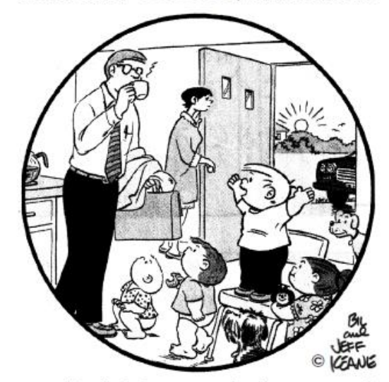
"Wouldn't it be better to retire from your work NOW, Daddy, while you can still play with us?"

from JoyfulNoiseletter.com