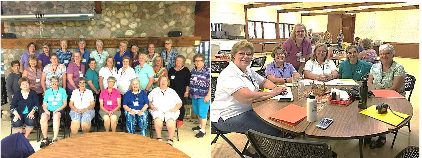
From the Dairyland/Lake Superior Conferences Retreat

The photo on the left is the entire group of women who gathered on August 16-17, 2018 at Luther Park in Chetek. The photo on the right is the Women of the ELCA from the Lake Superior Conference. It sounded like the joint venture was a success! Possibly other Conferences might want to try it also, to help promote learning about each conference and their similarities and differences.