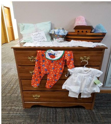
The Baby Bureau