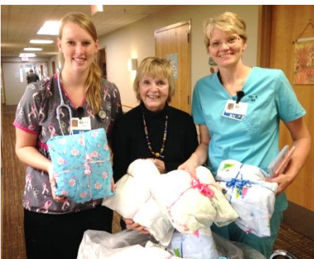
Delivery to Burnett Memorial Hospital, Grantsburg, WI