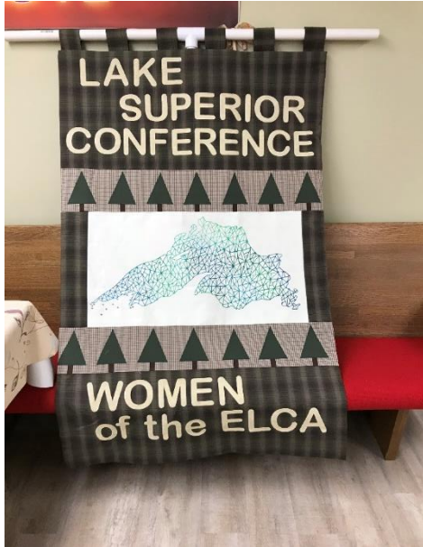
Lake Superior Conference