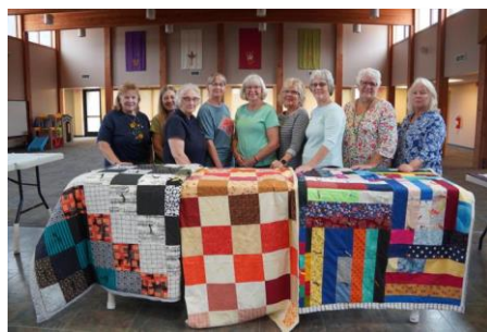
Peace Lutheran Quilters